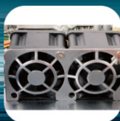
Optional 2 x front 40 mm fans