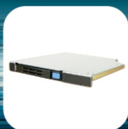
Slim ODD or 2.5 HDD with SK51102