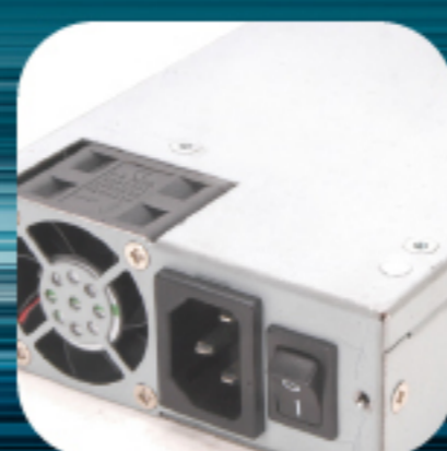
Flex ATX PSU (180W)