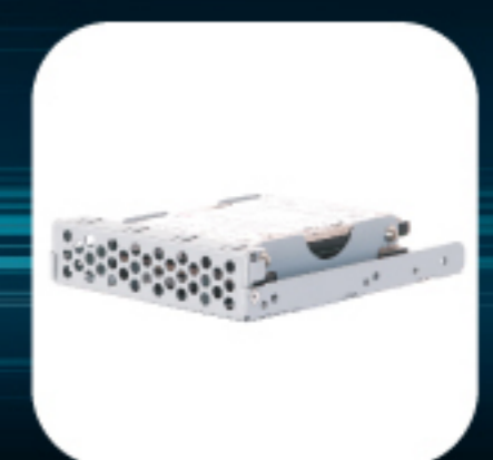
1 x Internal 3.5" bay for 3.5" or 2.5" HDD with SK41203