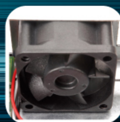
Optional 1 x rear 40 mm fan